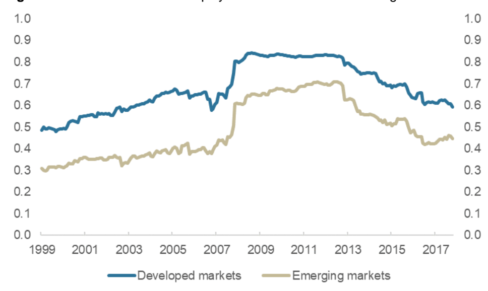
Figure 1: Correlation between equity markets within the same region

The figure shows the five-year rolling correlation between equity returns within developed markets and within emerging markets. Return measured in US dollars. Data for the period 1995 to 2018. Country classification updated monthly.