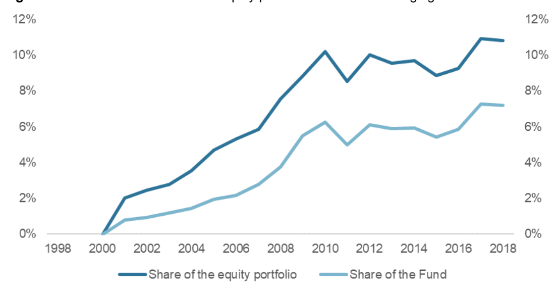
Figure 1: Share of the fund and the equity portfolio invested in emerging markets