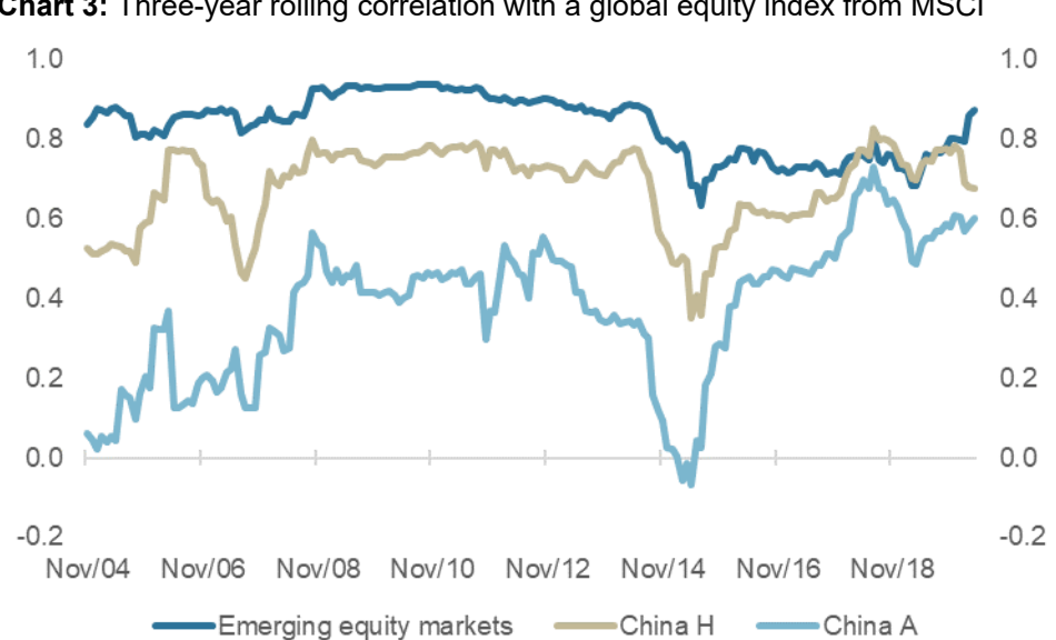
Chart 3: Three-year rolling correlation with a global equity index from MSCI