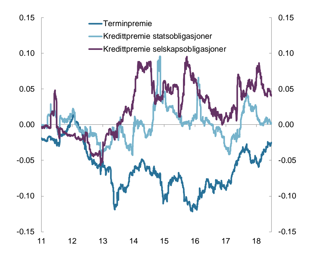
Chart 2. Factor exposures of fixed-income investments relative to benchmark. Coefficients

The analysis of the fund's fixed-income investments indicates, inter alia, that the fund had less covariance with long maturity bonds than the benchmark index at the end of the second quarter. The model's explanatory power was around 10 percent at the end of the quarter.