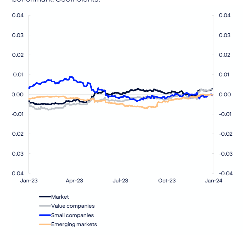
CHART 1. Factor exposures of the fund's equity management relative to benchmark. Coefficients.

Norges Bank Investment Management measures the fund's exposure to various systematic risk factors such as small companies, value stocks and bonds with credit premiums. Risk factors capture common variations in returns of securities with similar characteristics and contribute to both the risk and the return of the investments. Exposure to these factors can be estimated using the co-movement of the fund's historical relative return with the historical returns of the factors.